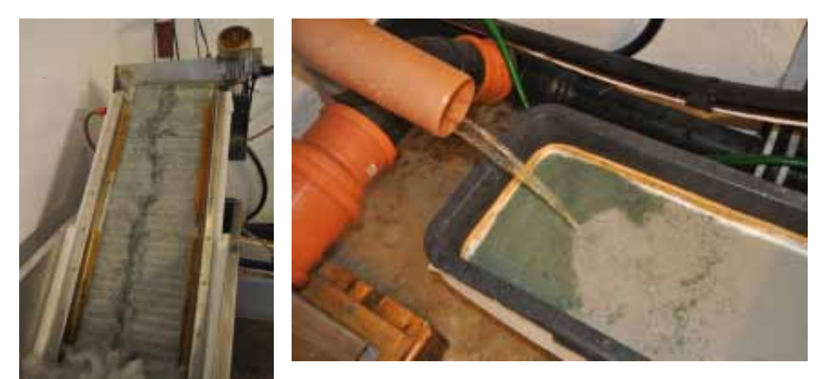
Figure 2 . Collection of waste particles on the filter screen (left) and collection of particles in the filter back-flush water (right).