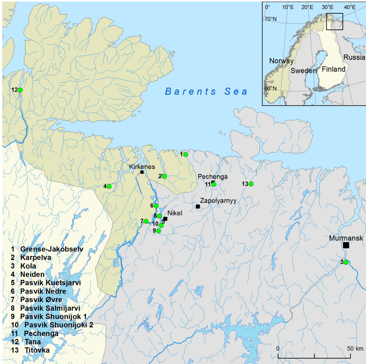
Figure 1. Overview of rivers and sampling sites in the Finnmark region and Kola peninsula