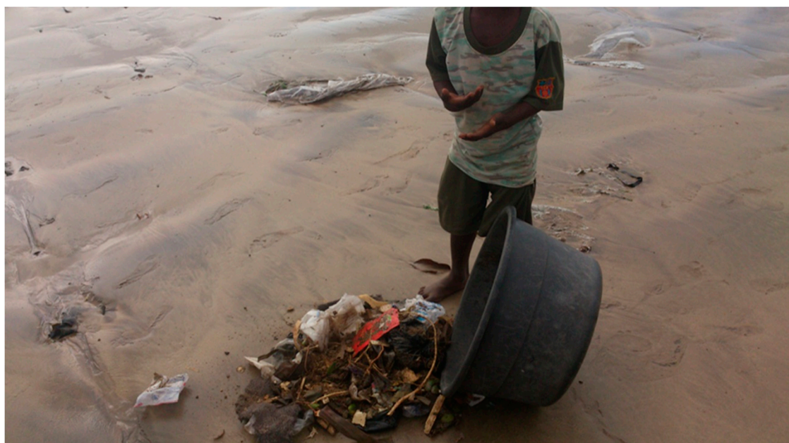
Figure 2. Child dumping solid waste, including plastic at the shore (2015, Ghana).

status in the future [169]. For example, the TeachWild program in Australia in connection with the Commonwealth Scientific and Industrial Research Organization (CSIRO), Earthwatch, and Shell Australia illustrates the role of education in managing marine plastic pollution [124]. The initiative encourages students to take part in citizen science, where the art of using the scientific process to examine marine debris are learnt [124]. In Ghana, for example (Figure 2), the lack of education and alternative disposal options encourage coastal communities to dump solid waste, including plastics on the beach and also into gutters during raining days to be carried directly into the sea.