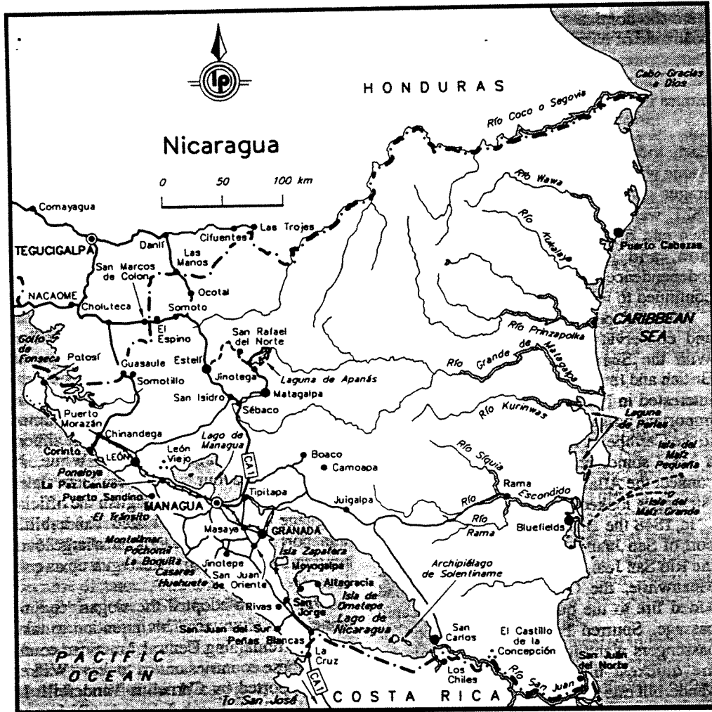
Figure. Map of Nicaragua.