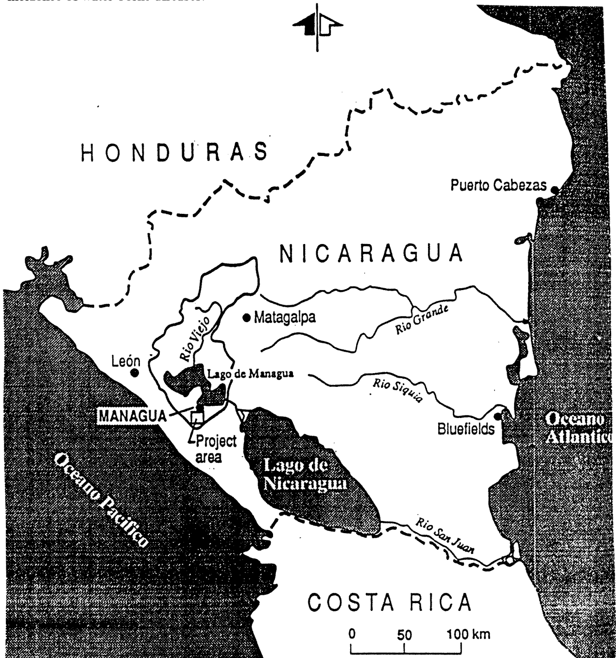
Figure. Map of Nicaragua showing the main rivers and lakes.

Many rivers and lakes are heavily polluted from discharge of untreated or insufficiently treated domestic and industrial waste water including agriculture runoff. The water pollution poses severe health hazard for the urban and rural population. The proximity of polluting activities to the drinking water sources and the poor quality of water and sanitation services, are causing a high incidence of water-borne diseases.