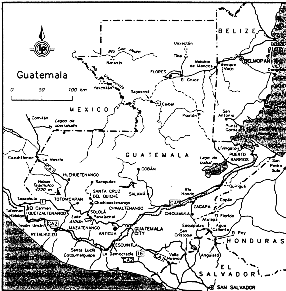
Figure 1. Map of the Republic of Guatemala

The country is administratively divided into 22 regions (departamentos). The capital of the country is Guatemala City with a population of about 3 million people. Guatemala City is the largest city in Central America.