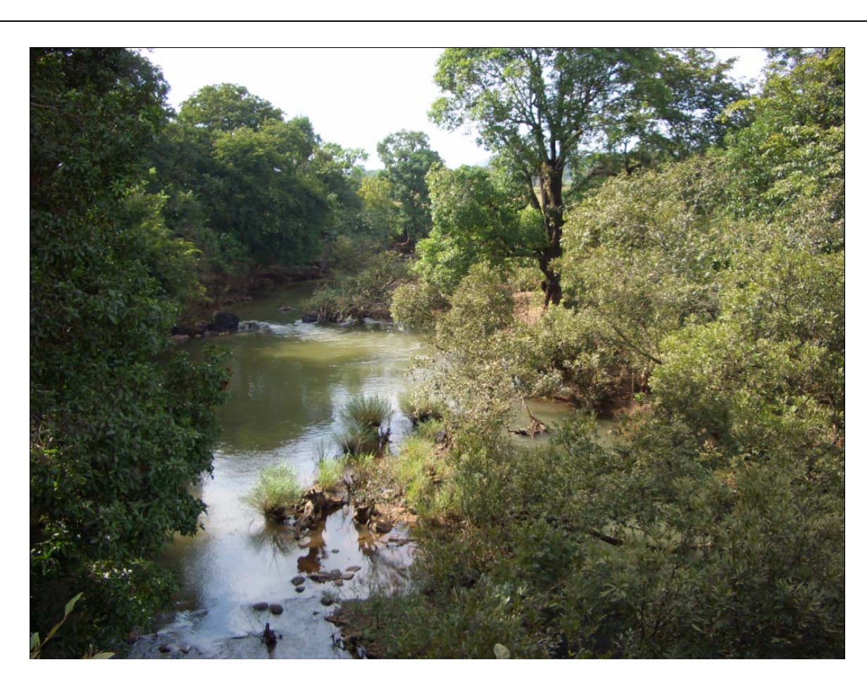
IND 3025 0/52 "Development of Tools and Methodologies to Implement the Payment for Environment Services (PES) concept in Watersheds in India" between Norwegian Institute for Water Research (NIVA) and Centre for Interdisciplinary Studies in Environment and Development (CISED), Bangalore, India (O-26314)

Part II: Evaluation of business opportunities