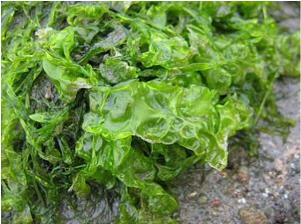
Figure 2: Ulva lactuca (www.wikipedia.org). Ulva are often able to thrive in polluted environments.

A green alga in the division Chlorophyta, is the type species of the genus Ulva, also known by the common name sea lettuce. The distribution is worldwide: Europe, North America - west and east coasts, Central America, Caribbean Islands, South America, Africa, Indian Ocean Islands, South-west Asia, China, Pacific Islands, Australia and New Zealand. This small green alga (up to 30 cm across) has a broad, crumpled frond that is tough, translucent and membranous. It is attached to rock via a small hold-fast (Pizzolla 2008). The sea lettuce is found at all levels of the intertidal, although in more northerly latitudes and in brackish habitats it is found in the shallow sublittoral. In very sheltered conditions, plants that have become detached from the substrate can continue to grow, forming extensive floating communities. The plant tolerates brackish conditions and can be found on suitable substrate in estuaries (www.wikipedia.org).