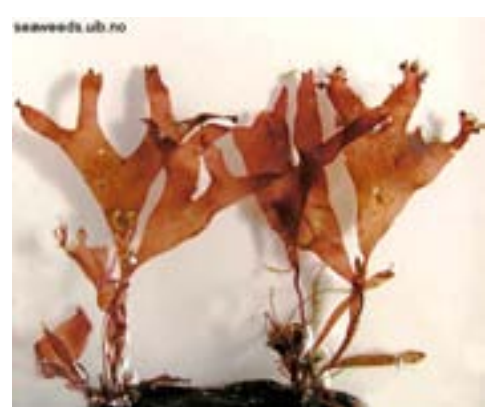
Figure 5: Coccotylus truncata

Like Phyllophora, Coccotylus truncata belongs to the red algae. It is a common species in the subtidal zone along the entire Norwegian coast. It can be difficult to separate the species from the Phyllophora spp., in particular Phyllophora pseudoceranoides (http://seaweeds.uib.no). The species thrives on blue mussels.