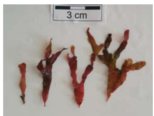
Figure 4: Specimen of Phyllophora crispa .

In Norway, the Phyllophora crispa growth in the sublittoral on rocks or on calcareous sand/pebble and are distributed north of Trondheim (http://seaweeds.uib.no). Considered to be rare, it can sometimes occur in large numbers at the Norwegian west coast. Although this minor wild crop is used for food & galactans, it's main use is as food for animals, fertilizer, and food ingredient (http://www.seavegetables.com).