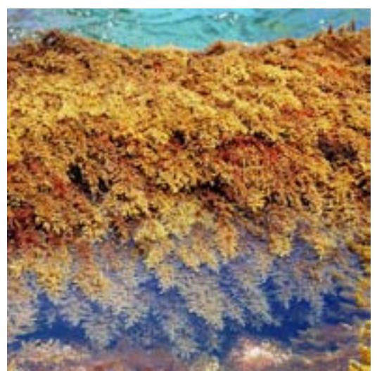
Figure 3: Cystoseira community.

Cystoseira osmundacea needs a hard, rocky substratum, a well-illuminated habitat, and cannot withstand much desiccation. Thus an ideal habitat for this alga would be the sublittoral rocky sea floor, although some specimens can be found in deep rocky tide pools. Several studies have observed the distributions of C. osmundacea in its environment, and the pattern that emerges is that of high abundances of Cystoseira between four and eight meters depth, with an abrupt drop in abundance past ten meters depth. Plants tend not to be abundant in the shallowest areas. Lower abundances in deep water may be a function of diminishing light, and the absence of Cystoseira in shallow waters may be a function of severe wave force during those violent winter storms. Although some plants do occur past ten meters, their growth tends to be stunted. (http://www.mbari.org). Cystoseira is found mostly in temperate regions of the Northern Hemisphere, such as the Mediterranean, Indian, and Pacific Oceans.