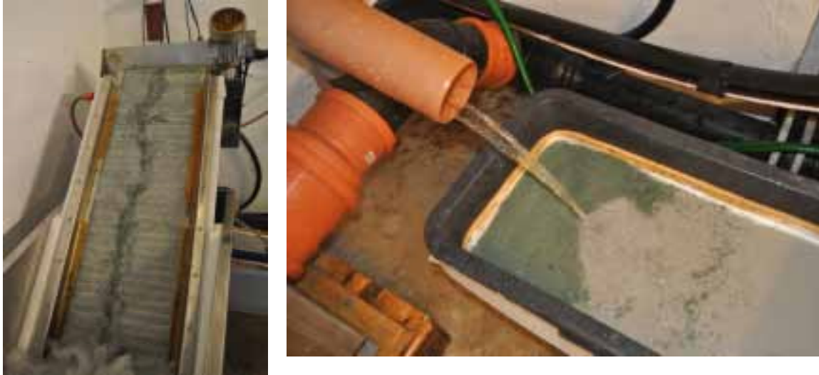
Figure 2. Collection of waste particles on the filter screen (left) and collection of particles in the filter back-flush water (right).