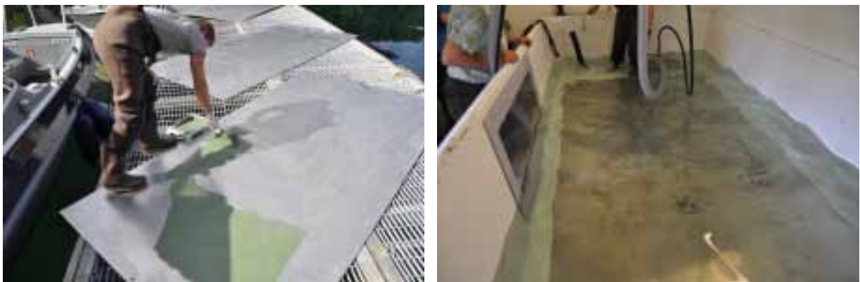
Figure 1. Painting of the steel plates (left), and cleaning of the steel plates in the test-tank (right).

Suspended solid (SS) was determined by the Eurofins Laboratory, Moss, Norway according to NS-EN 872 and NS 4733. A glassfiber filter GF/F (0.7 \mu\text{m} ) is washed with distilled water, dried at 105 °C for 30 minutes, then ignited at 480 °C for 2 hours and finally weighed. A known volume of the sample is filtered and the filter was dried for 2 hour and weighed. The SS is represented by the weight increase. Lowest reported value: 1.5 mg/l.