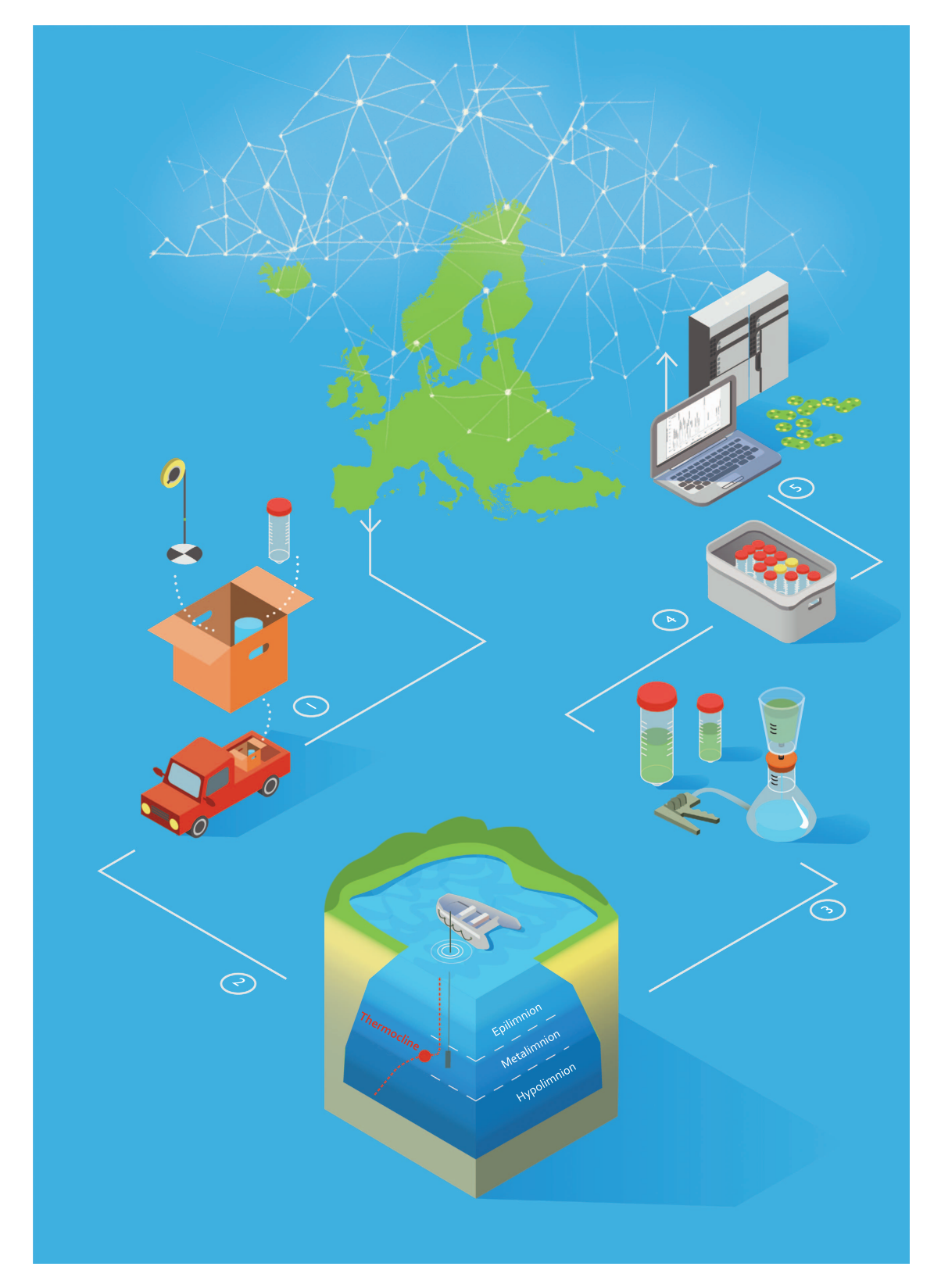
Figure 2. Schematic overview of the European Multi Lake Survey (EMLS). CyanoCOST and NETLAKE members performed the sampling routine by: 1. Preparing the sampling material to meet the standardized procedures 2. Accessing the lake site and acquiring integrated water samples from the bottom of the thermocline up to the water surface 3. Processing and preserving the water samples based on requirements for subsequent analysis 4. Shipping samples to a central receiving laboratory 5. Analysing nutrient, pigment and toxin concentrations in dedicated laboratories. After quality control checks and data integration the dataset returns to the European network and becomes publically available for further research. Created by Sarah O'Leary and Eilish Beirne.