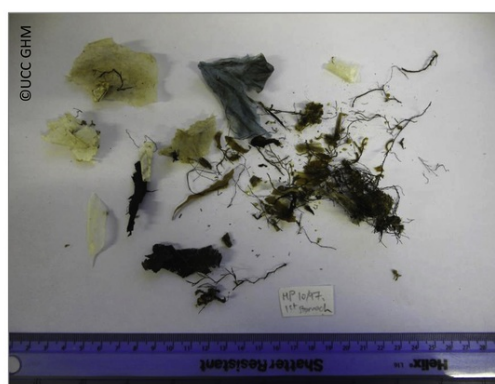
Fig. 1 Marine litter ingested by stranded cetaceans (sperm whale, harbour porpoise and striped dolphin) in European coasts.