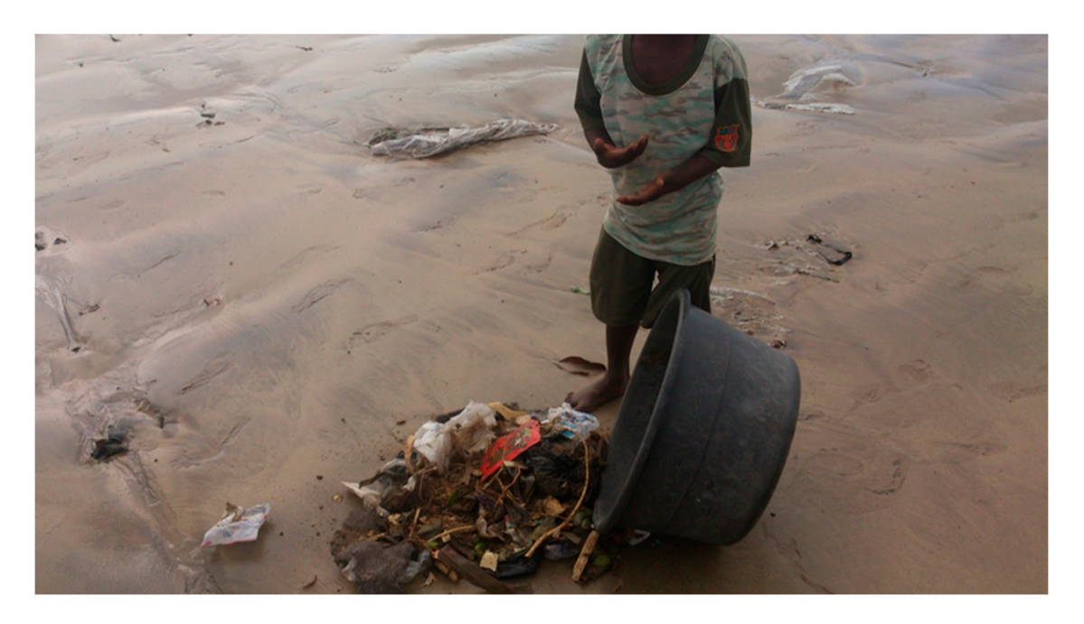
Figure 2. Child dumping solid waste, including plastic at the shore (2015, Ghana).

status in the future [169]. For example, the TeachWild program in Australia in connection with the Commonwealth Scientific and Industrial Research Organization (CSIRO), Earthwatch, and Shell Australia illustrates the role of education in managing marine plastic pollution [124]. The initiative encourages students to take part in citizen science, where the art of using the scientific process to examine marine debris are learnt [124]. In Ghana, for example (Figure 2), the lack of education and alternative disposal options encourage coastal communities to dump solid waste, including plastics on the beach and also into gutters during raining days to be carried directly into the sea.