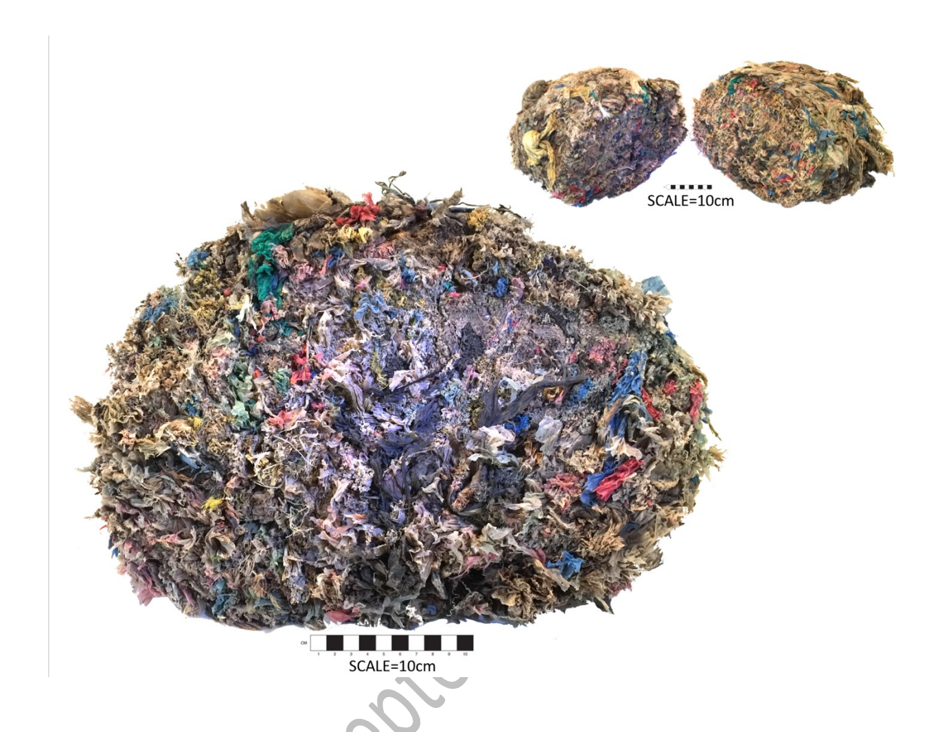
Figure 5. Bezoar D split to expose an interior of compacted plastic film.