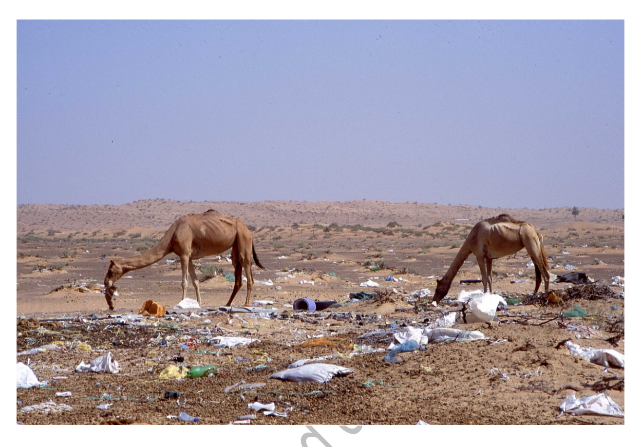
Figure 1. Two camels ( Camelus dromedarius ) foraging on plastic waste in the desert near Dubai, UAE.

The Central Veterinary Research Laboratory (CVRL) in Dubai, UAE has evaluated over 30,000 camels since 2008, both in the laboratory and in the field. CVRL has documented 300 cases of mortality due to ingesting anthropogenic waste that form polybezoars, ranging in weight from 1kg to 50kg, and primarily plastic bags and ropes (Wernery et al. 2014). They have been observed to die for several reasons: