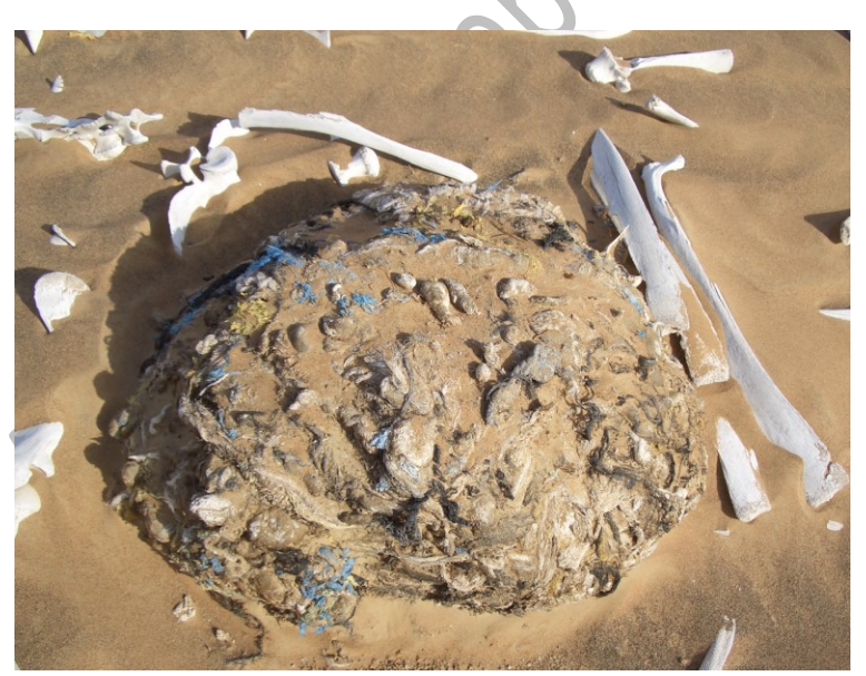
Figure 3. Polybezoar E discovered in situ inside a desiccated camel skeleton found in the desert south of Dubai, United Arab Emirates.